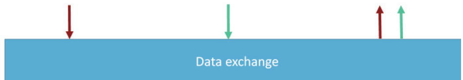
Organic Services overview: An overview of Organic Services' integrity tools.

management, audit documentation, non-compliance follow-up, external reporting (market, certification) and internal quality verification system management processes (eg, ICS, PGS and GLOBALG.A.P. Option 2). Organic Services believes that all producers should have access to professional tools, regardless of their size.